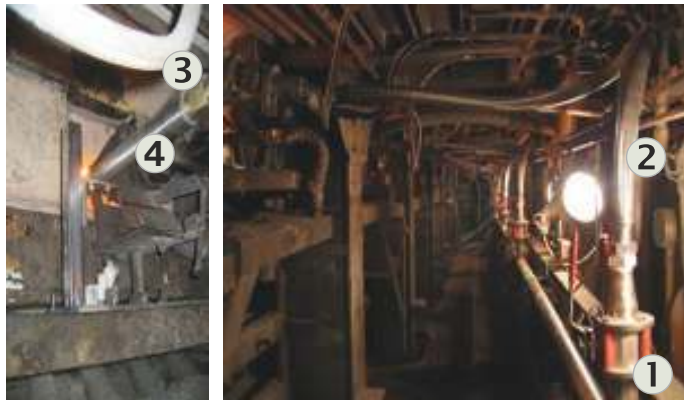
1 Manual ball valve at each point of use